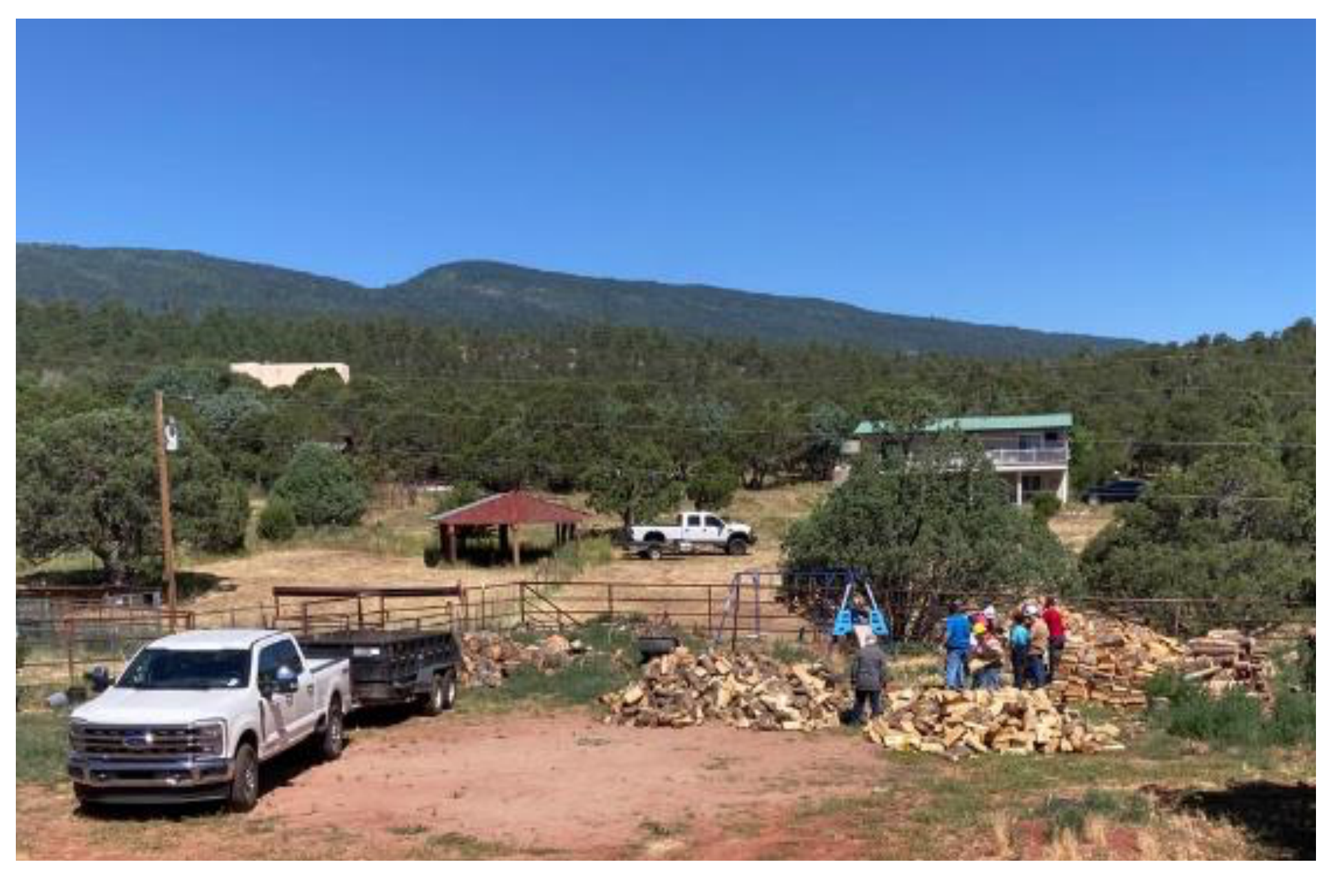
The trailer load of wood has been dumped in the woodlot, and the Scouts are completing the project by stacking the wood.