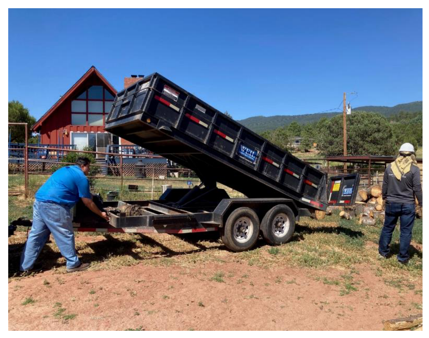
Chris dumping wood from trailer.