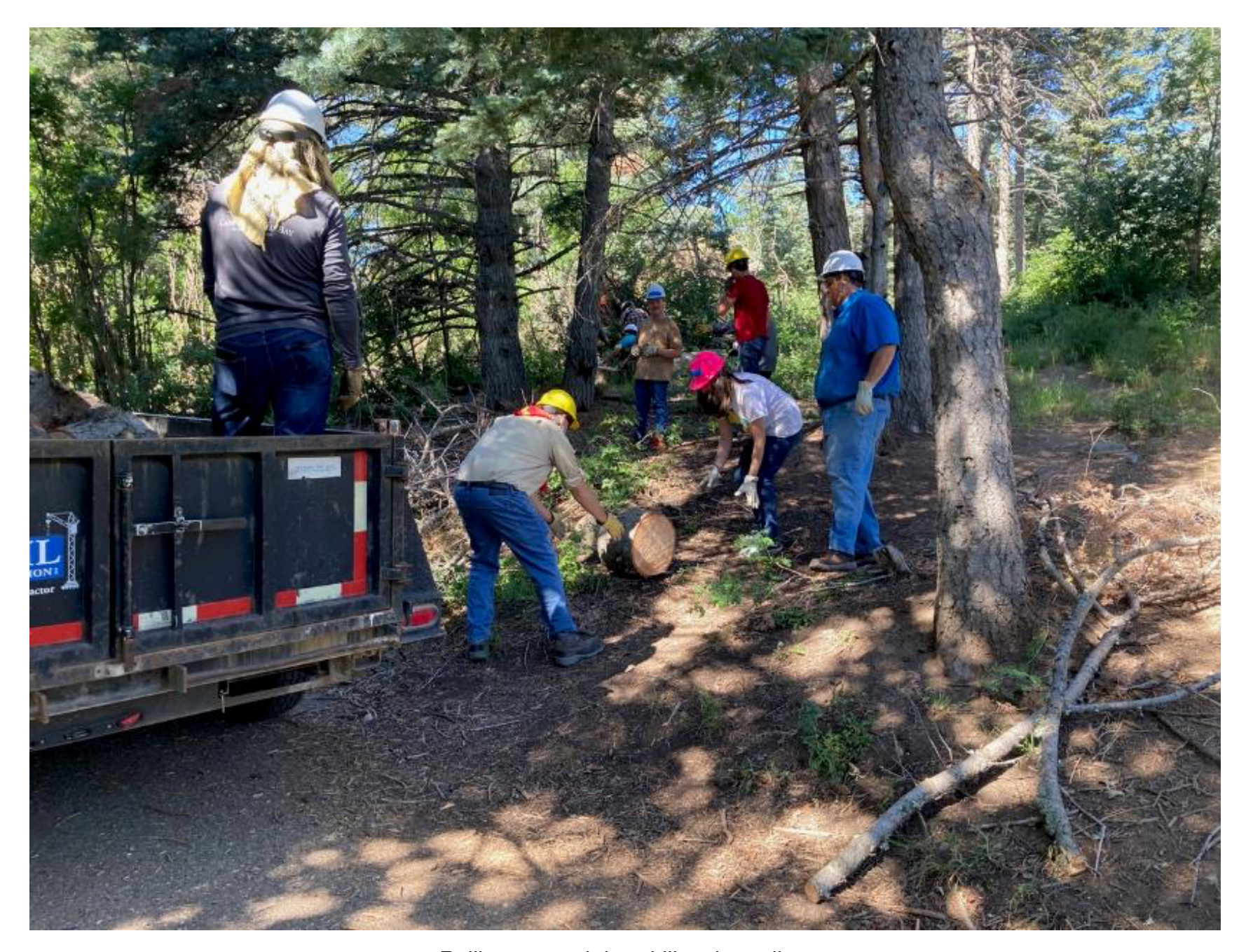
Rolling a round downhill to the trailer.