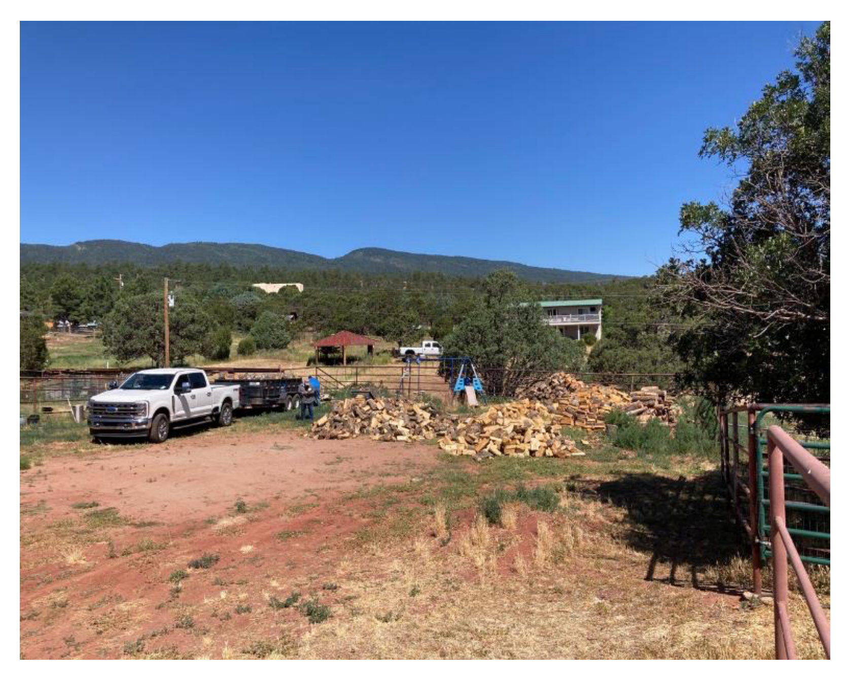
Truck and trailer in Mountain Christian Church woodlot.