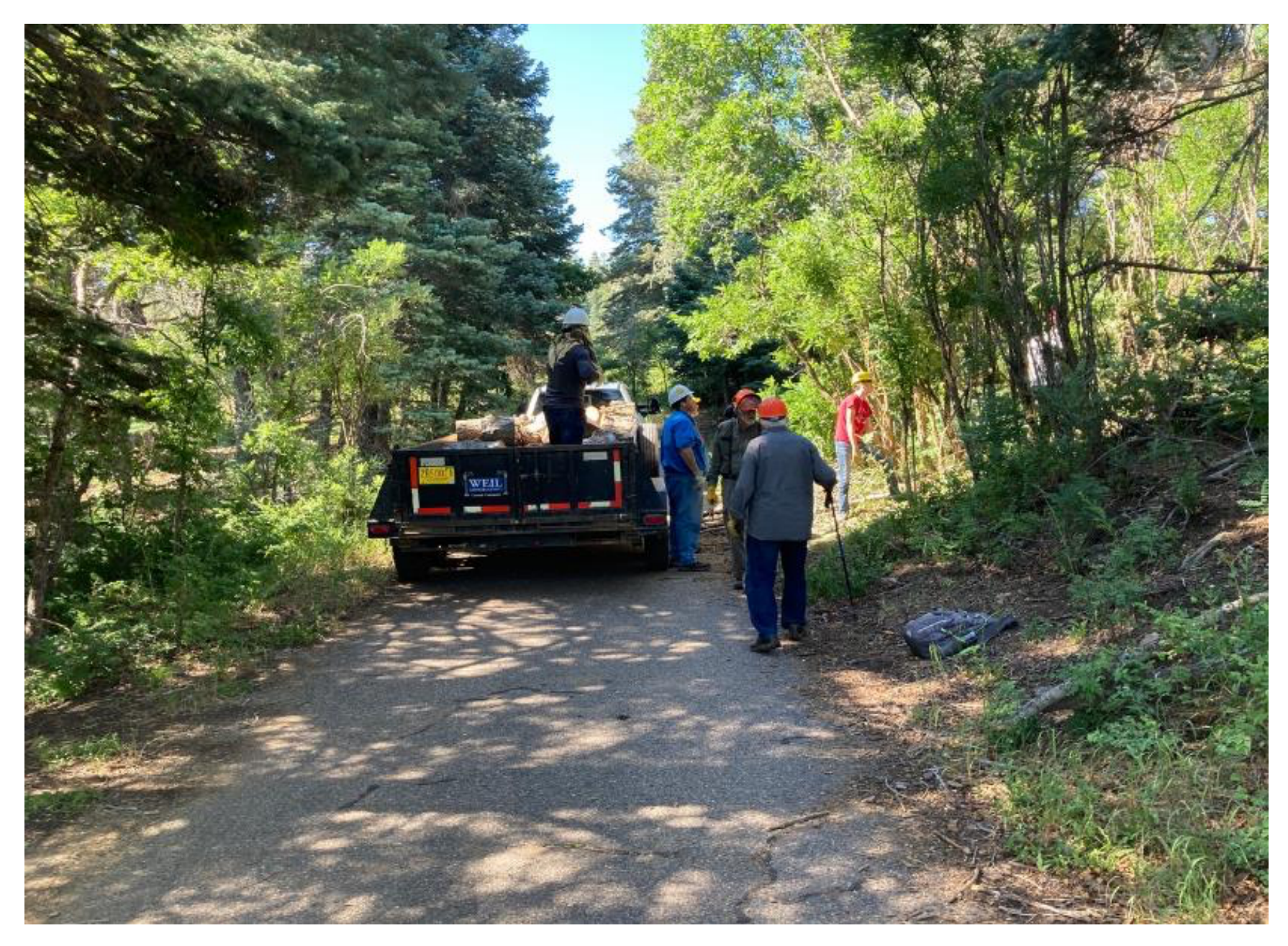
Troop rolling rounds downhill while Sam and Lou observe.