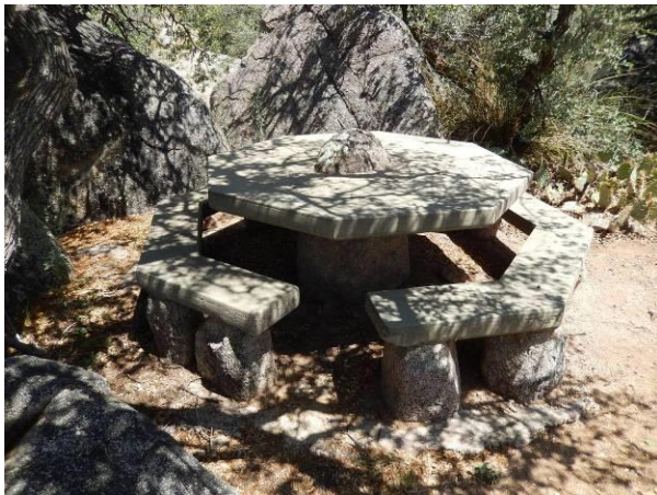
Octagonal table with small granite rock in the center and concrete benches set on granite boulders.

At 12:30 pm, the NTD volunteers gathered at the Kiwanis Shelter at Elena Gallegos Picnic Area for a lunch of sandwiches, chips, and drinks. After lunch six of the eight FOSM volunteers won door prizes. (Dan Benton and Sam Beard)