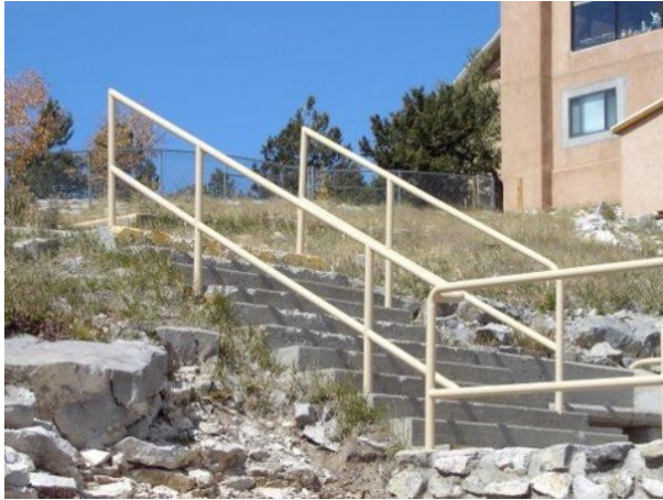
Steel hand railings painted by Paint Crew at Sandia Crest.