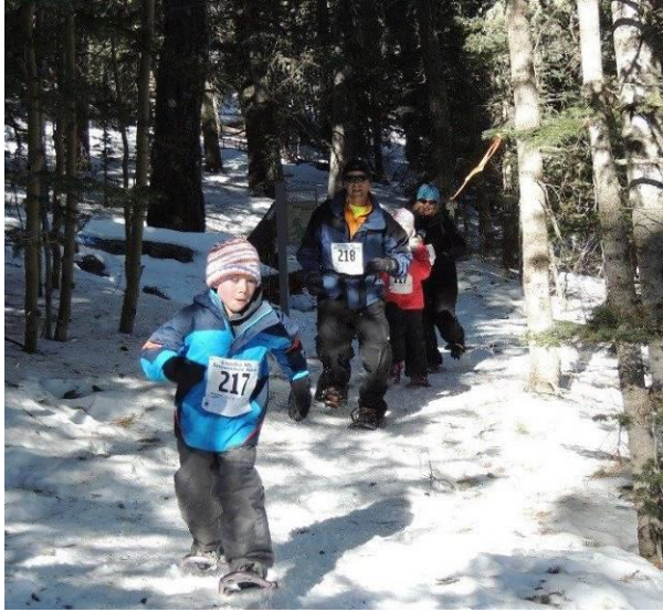
Young boy in snowshoe race