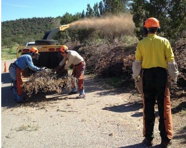
Chipping slash near vehicle gate