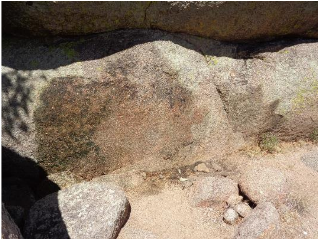
Before and after graffiti remover was used on a Juan Tabo Picnic Area boulder in July.