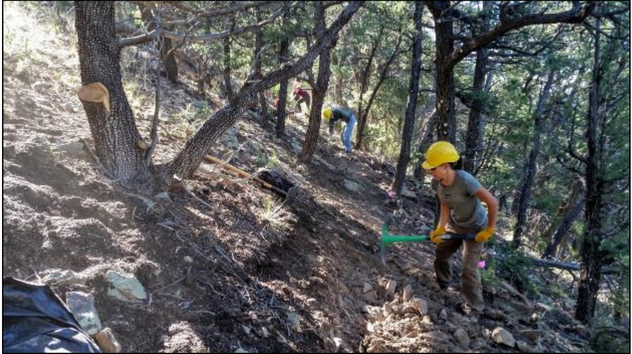
Steep side slope and rocky terrain make for tough cutting.