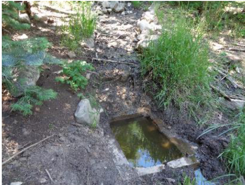
Clear water in trough on June 4. The trough is a 55-gallon steel drum cut length wise and set in concrete. (Lou Romero and Sam Beard)