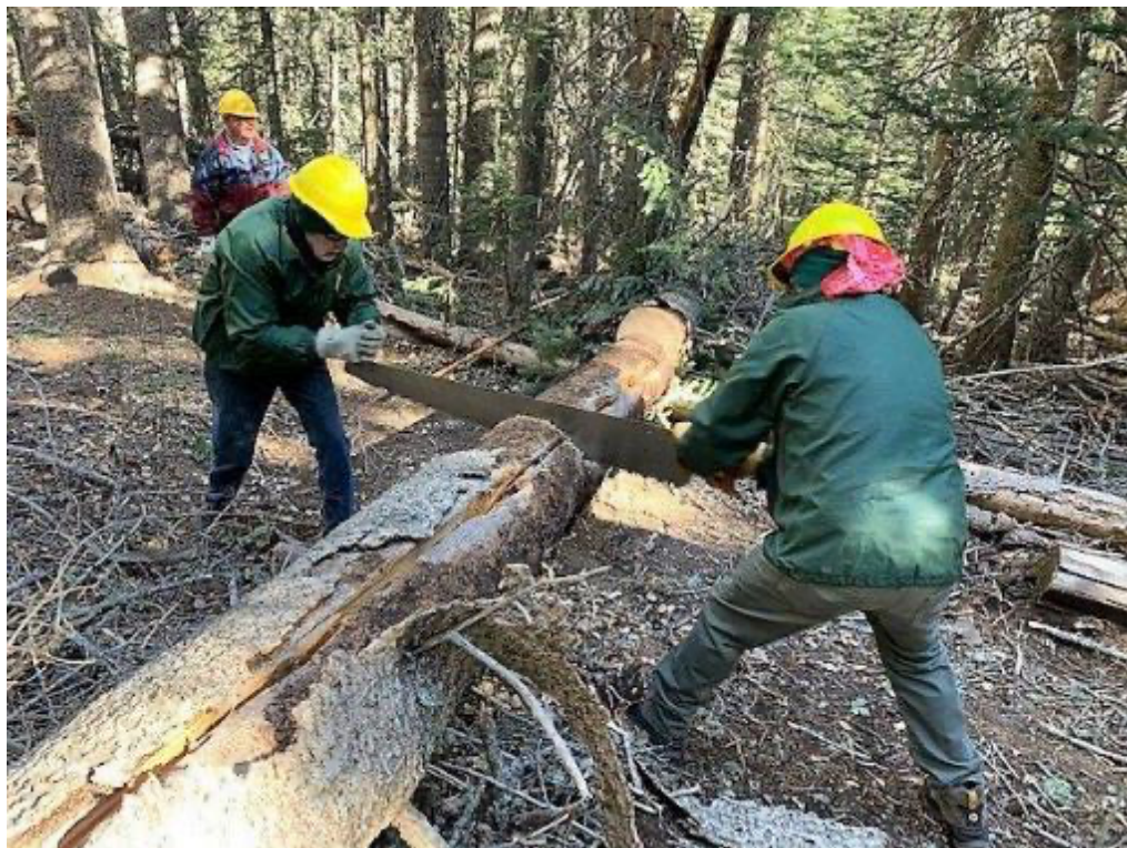
Trails Crew using a crosscut saw on Survey Trail.