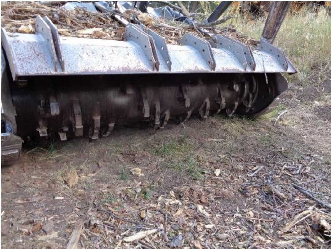
Masticator used the thinned areas at Dry Camp Trailhead and Nine Mile Picnic Area