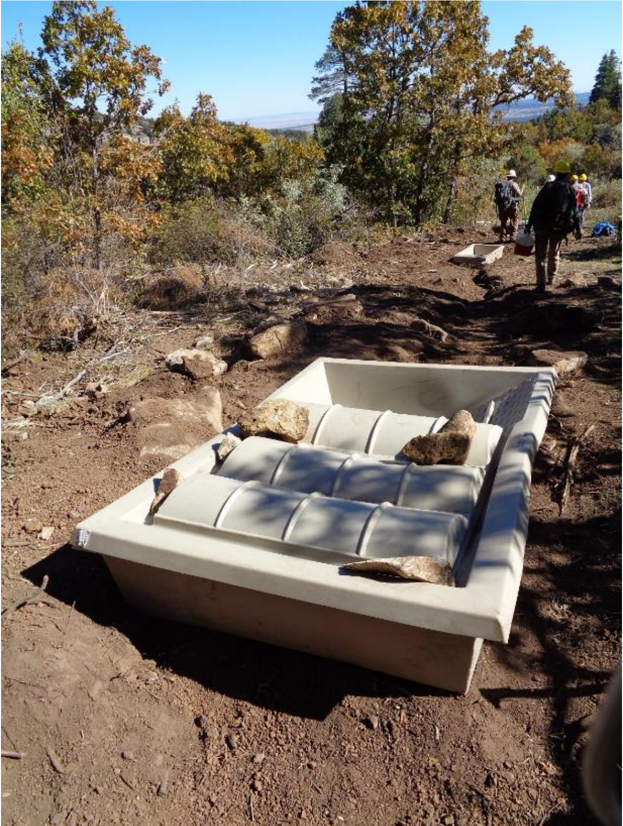
A new wildlife rain collector and drinker were installed at the Barro site in the fall of 2019.