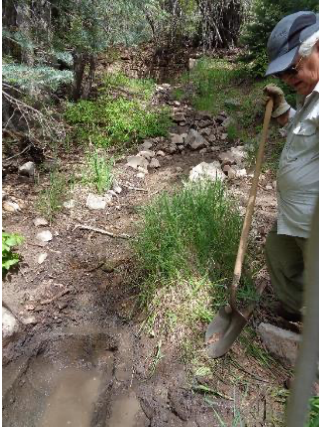
Tree spring wildlife water trough was cleaned out on May 19. Tree Spring is in the background at the stone walls just below the Old Crest Highway.