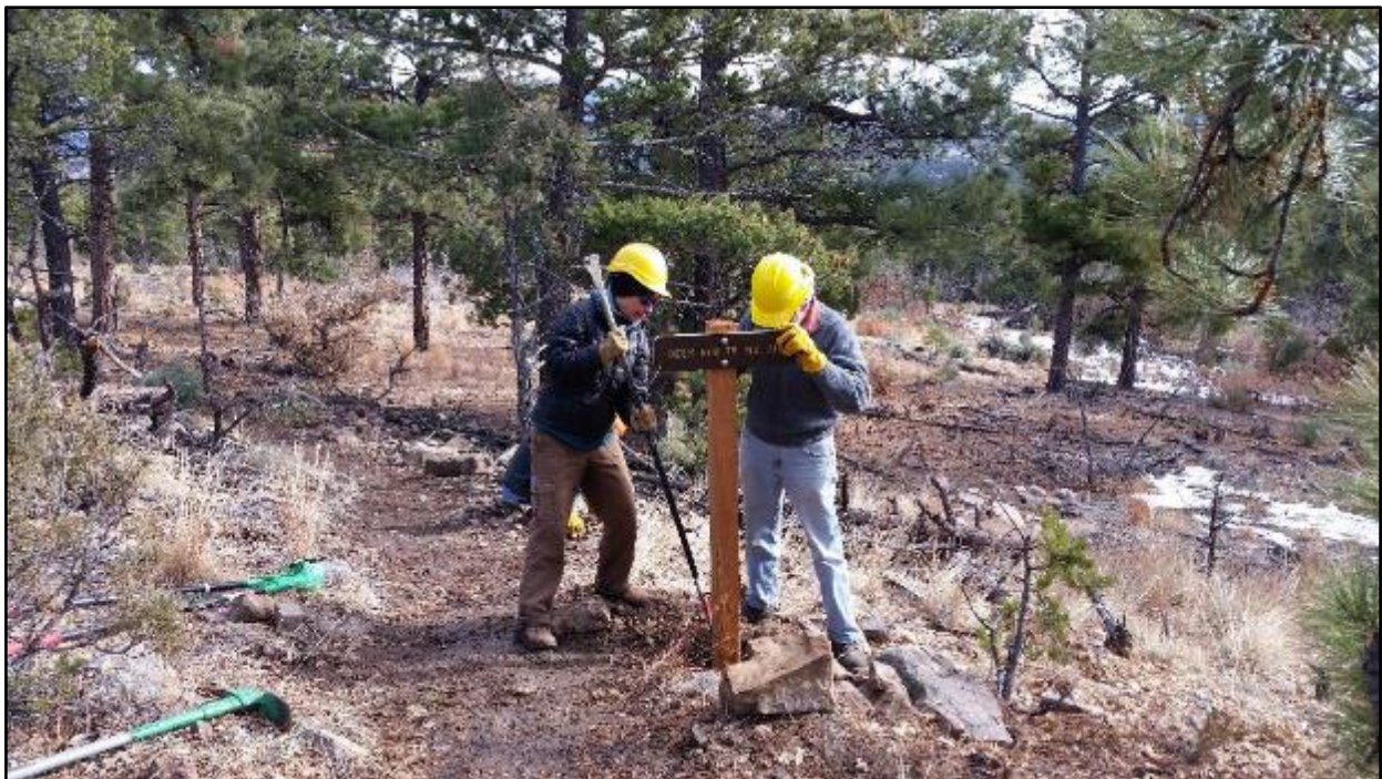
Last sign before winter.