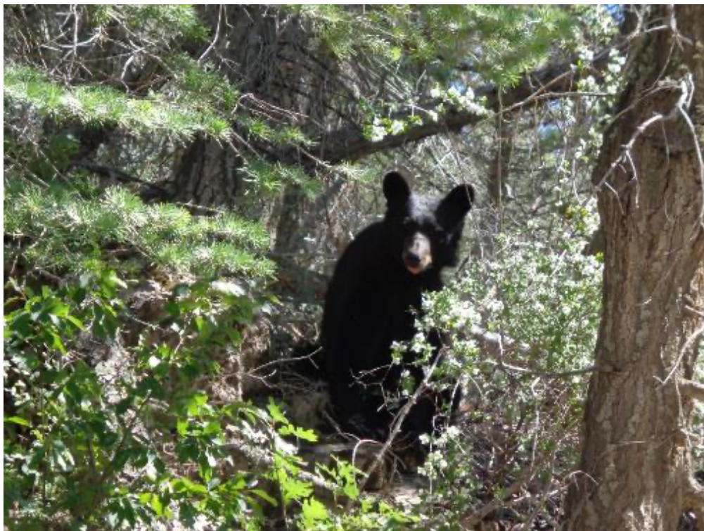
Black bear seen by Lou Romero and Sam Beard on NM-165 (Placitas Road) on June 24.