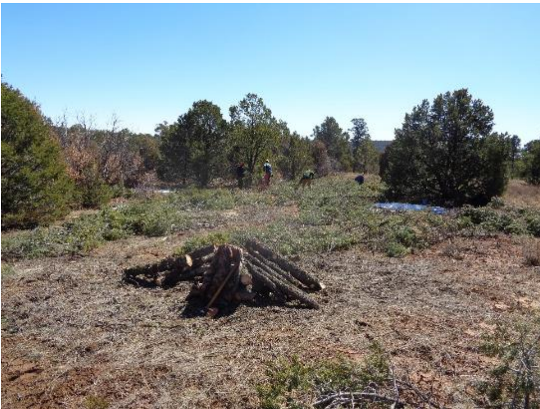
Volunteers thinning the Cedro CFRP area in the fall (Top 11-19-19) and spring (Bottom 3-4-20).