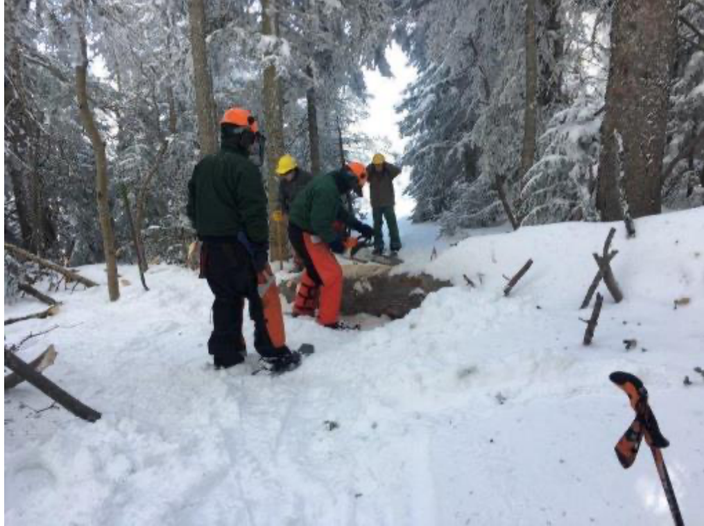
Trails Crew bucking a log in the snow on Gravel Pit Trail.