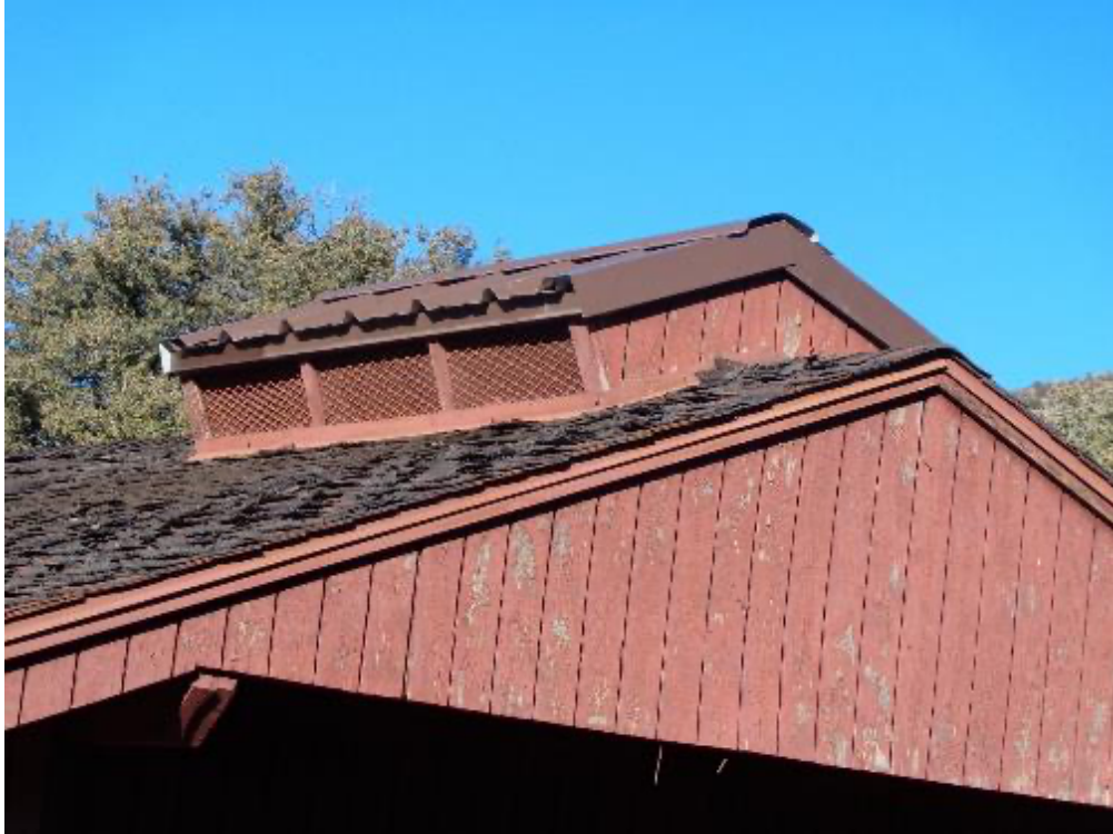
New metal roof on restroom vent structure in La Cueva PA. Note the turned-up edges of the old shingles on the building roof.