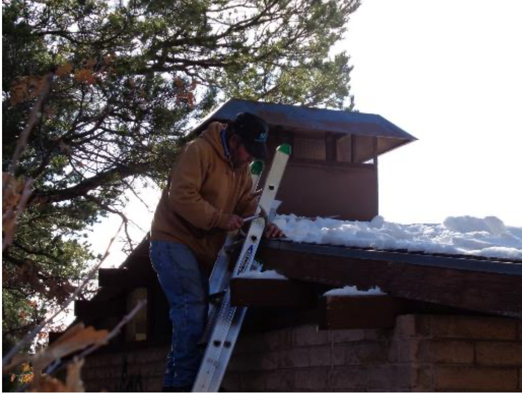
Russ Parker patching hole in Oak Flat Group PA restroom roof with steel flashing in November.