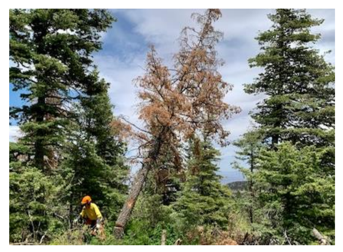
Bob Lowder moving away from the hazard tree he has just felled at the Capulin Snow Play Area.