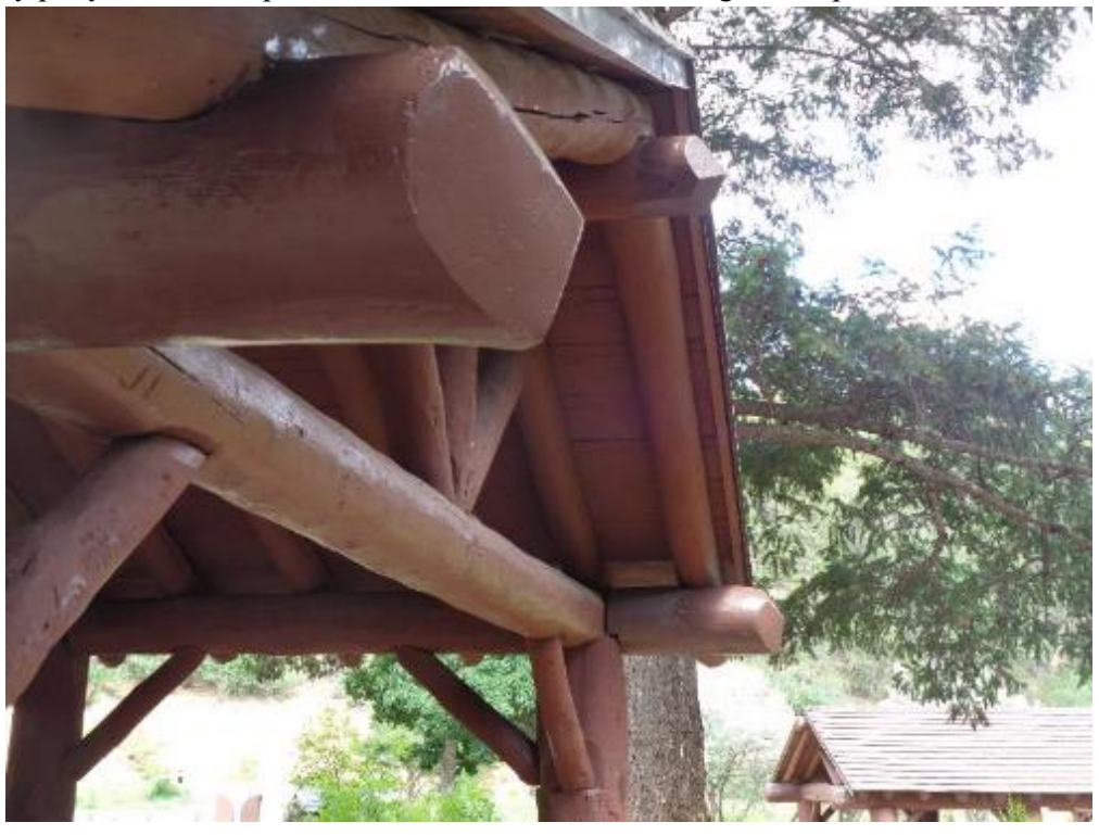
South end of the CCC shelter in Doc Long Picnic Area with three restored beams -- two large horizontal beams and the ridge pole.

North end of ridge pole showing damage due to exposure to weather for 85 years. Screws provide anchors for epoxy putty that will be placed on the beam to restore its original shape with three flat facets.