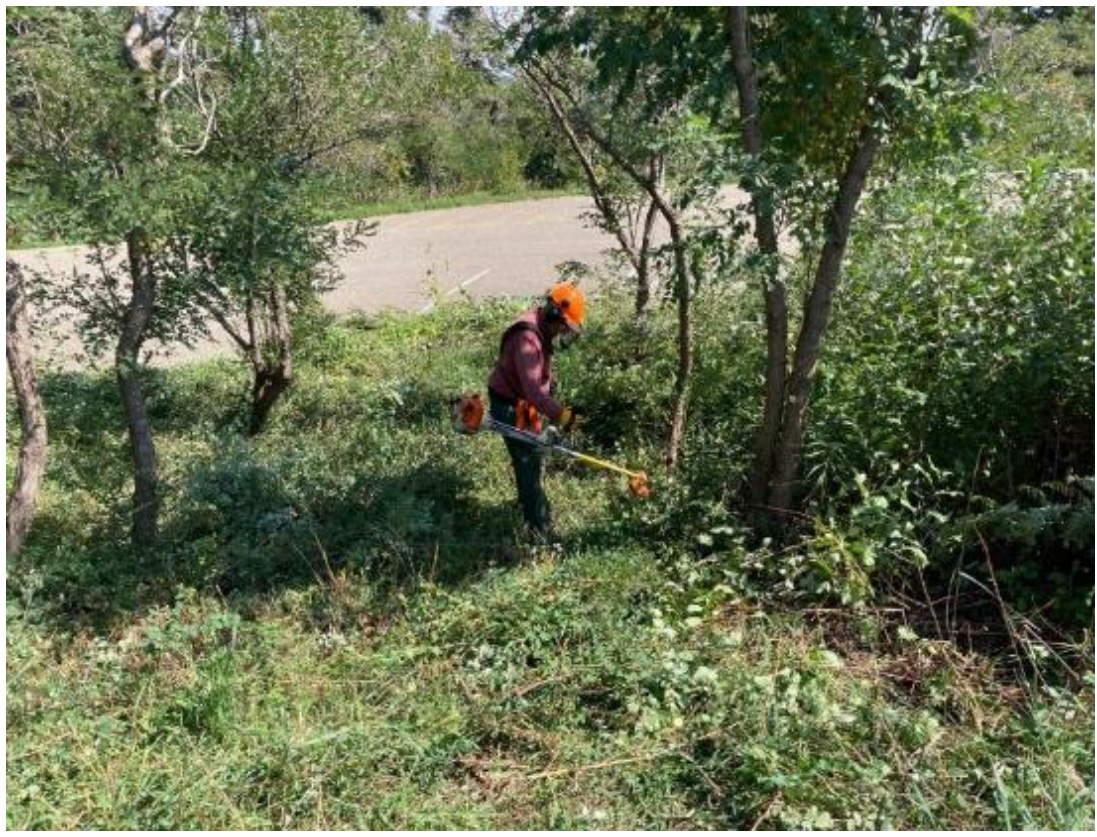
Jerry Carroll cutting brush with the large FOSM power brush cutter in the traffic island.