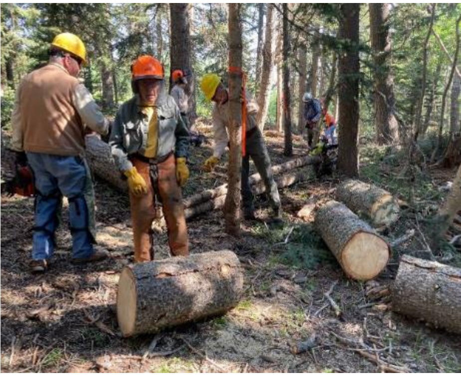
Volunteers removing trees from a Sandia Nordic Ski Club groomed trail near 10K South Trailhead.