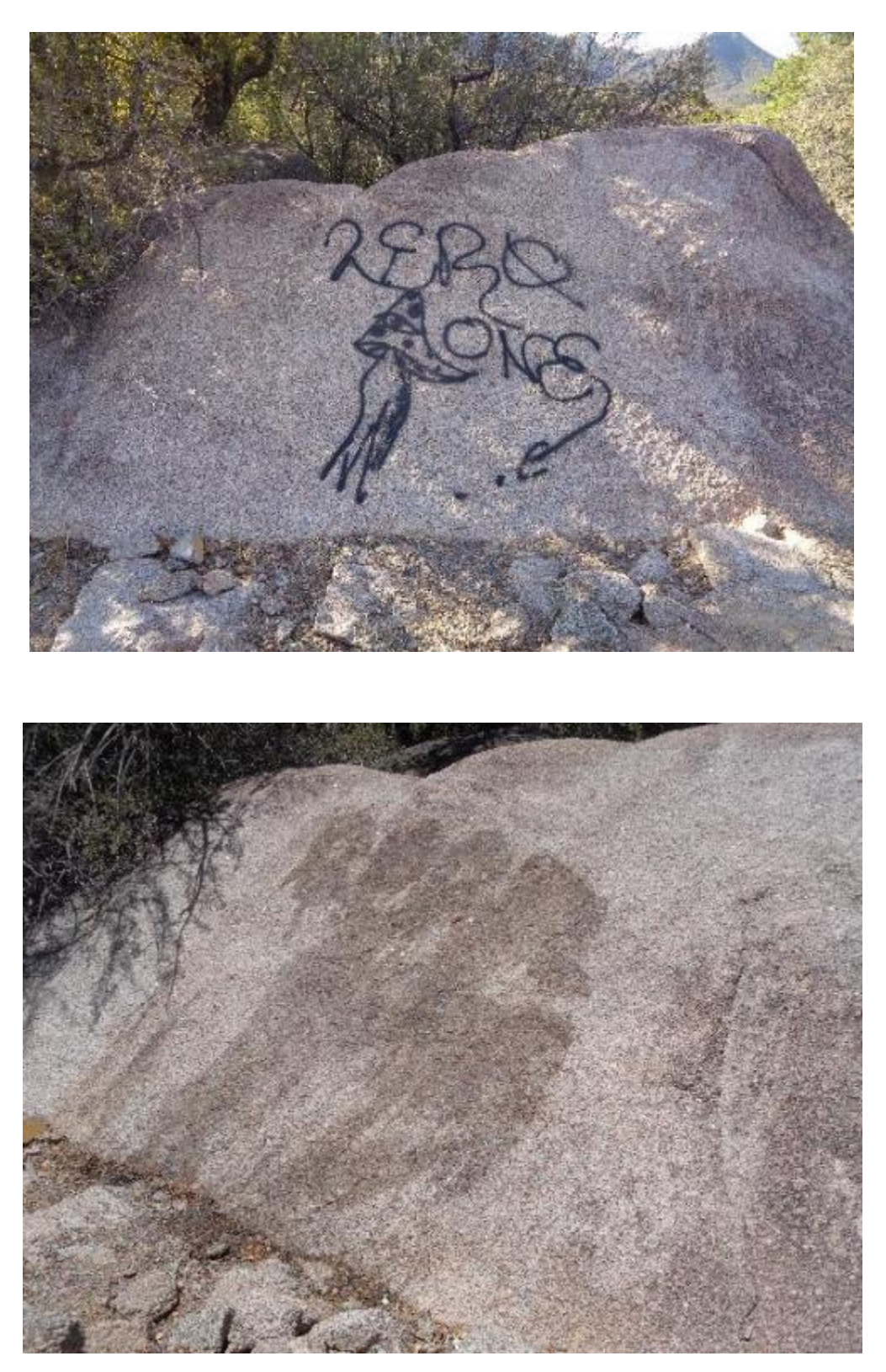
Before and after photographs of a boulder at the Juan Tabo Picnic Shelter where graffiti was removed.