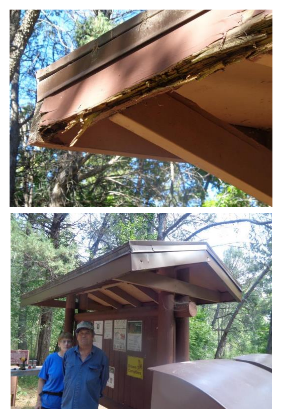
Ellie and Russ Parker are standing at the large kiosk across Cienega Picnic Area Road from the second restroom. The decayed wooden fascia in the top photograph has been covered with a custom-made brown sheet steel feature that will prevent further decay and be attractive.