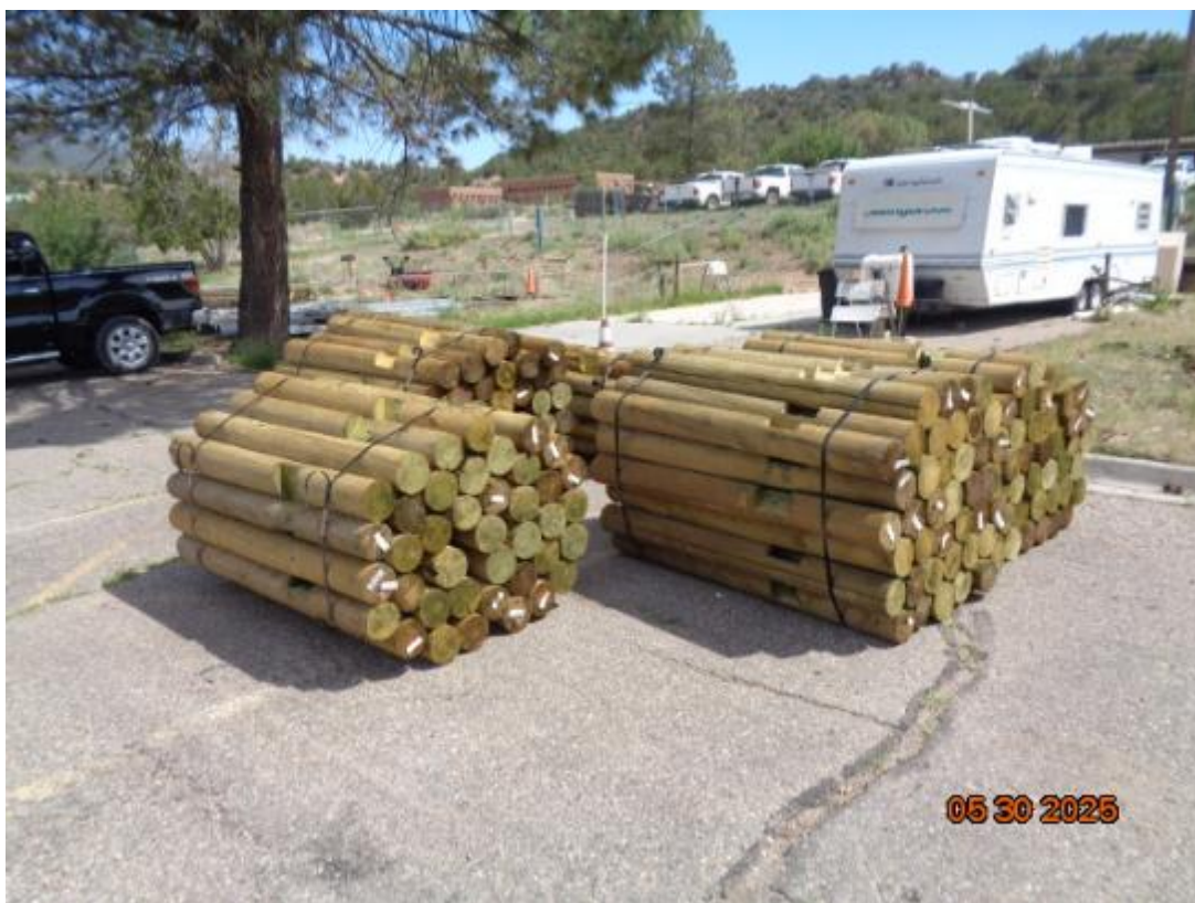
Top -- Manny is unloading the last bundle of posts from the trailer. Bottom – The posts have been stored in the parking lot near the hazmat building.