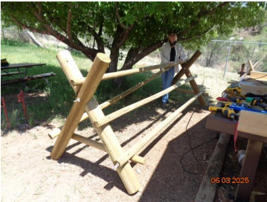
Top – Joelle with the first buck fabricated with the treated materials. Bottom – A section of the type of fence that will be constructed on the north and south sides of Kiwanis Meadow to discourage hiking in the meadow and the formation of unofficial user trails.