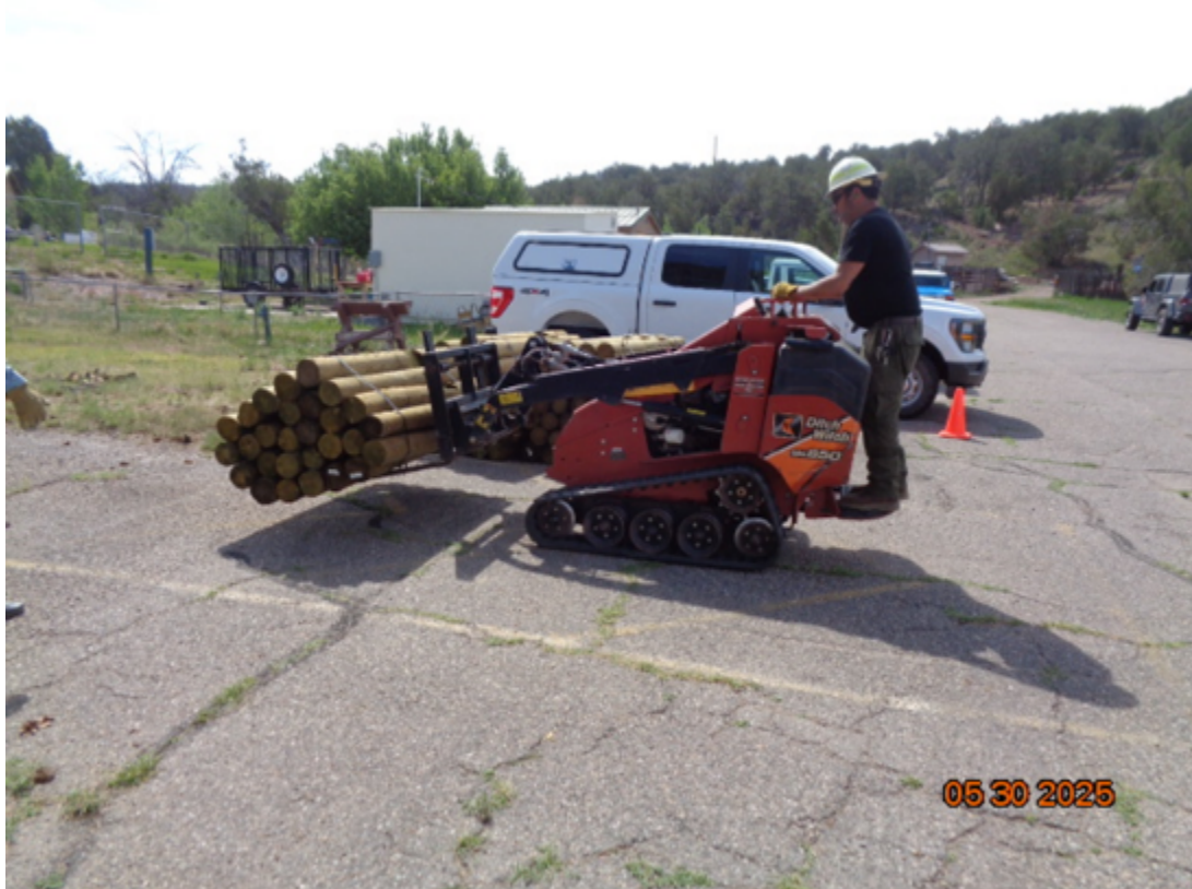
Manny is unloading a bundle of posts and taking them to a location near the hazmat building behind the Ranger Station.