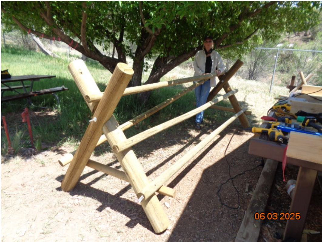
Top – Two TTYL/YCC crew members fabricating the last buck for the new fence using Joelle’s jig to align the buck legs and the brace. Bottom – Joelle with the fence section that was assembled at the FOSM Guard Station to learn fabrication procedures for the 1000 feet of fence that will be constructed at Kiwanis Meadow.