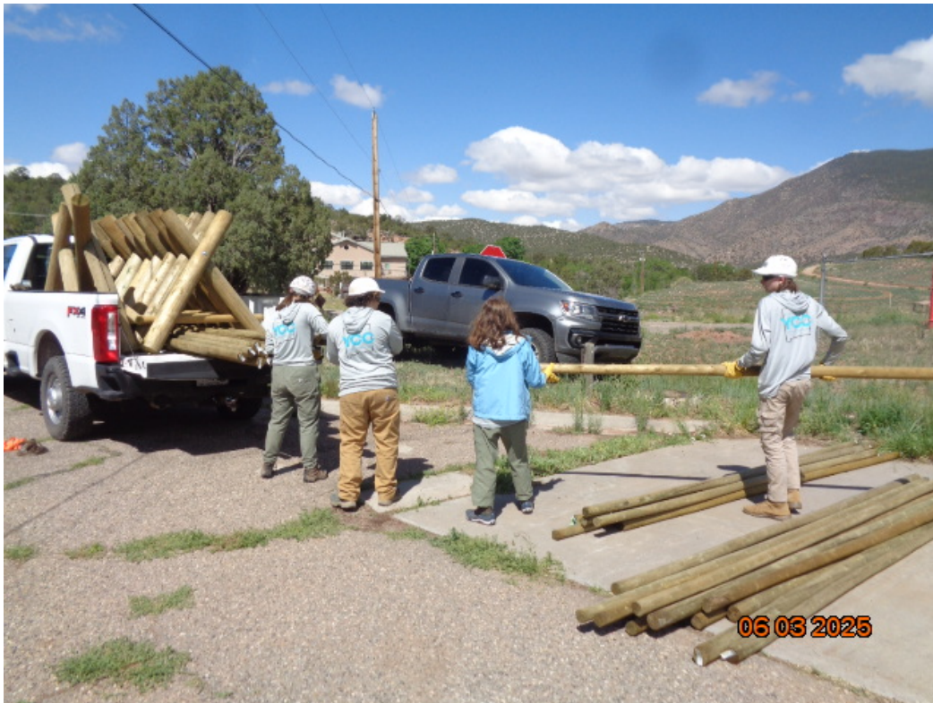
Top – Canyon Young, SRD Trails and Wilderness Program Manager, loading bucks on an SRD pickup with TTYL/YCC crew members observing. Bottom – TTYL/YCC crew members loading rails on the pickup. Canyon hauled the bucks and rails to Kiwanis Meadow where a buck and rail fence will be constructed.