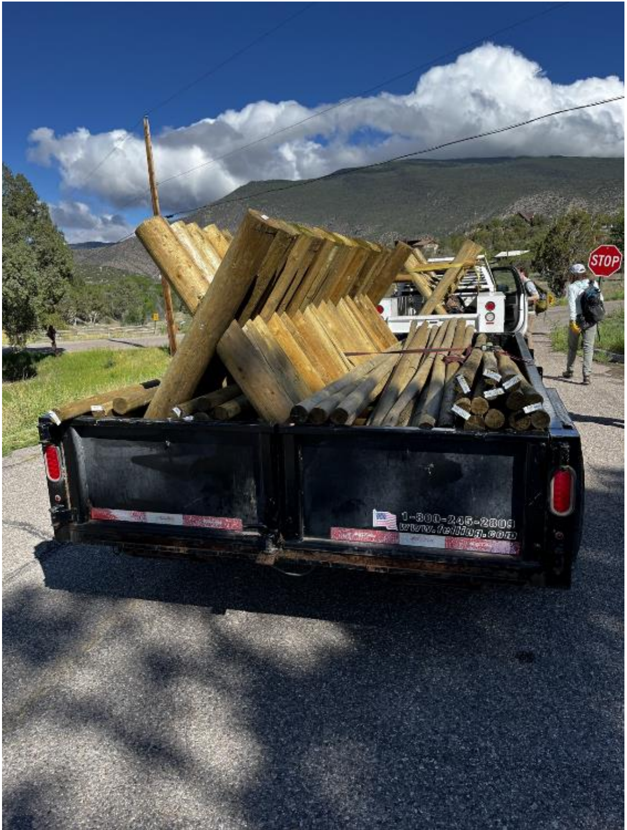
Bucks and rails on a trailer and pickup that Manny Chavez will drive to Sandia Crest. The bucks and rails on the trailer were transferred to pickups and hauled down the rough Kiwanis Cabin Road to the meadow.