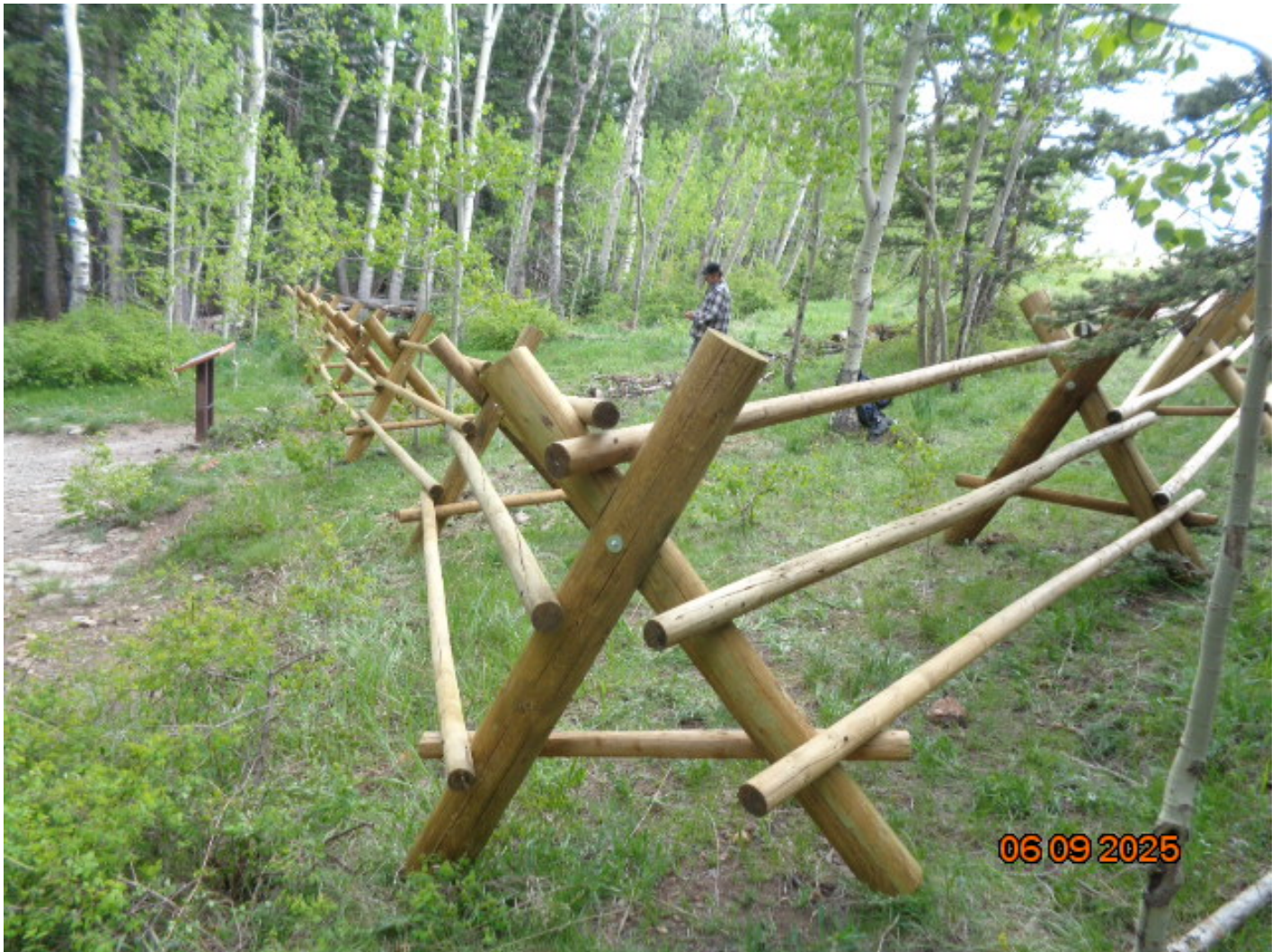
View from the last corner in the section of the fence adjacent to the South Crest Trail toward the end of the fence in the edge of the forest in the background. The interpretative sign on the left presents information about the meadow.