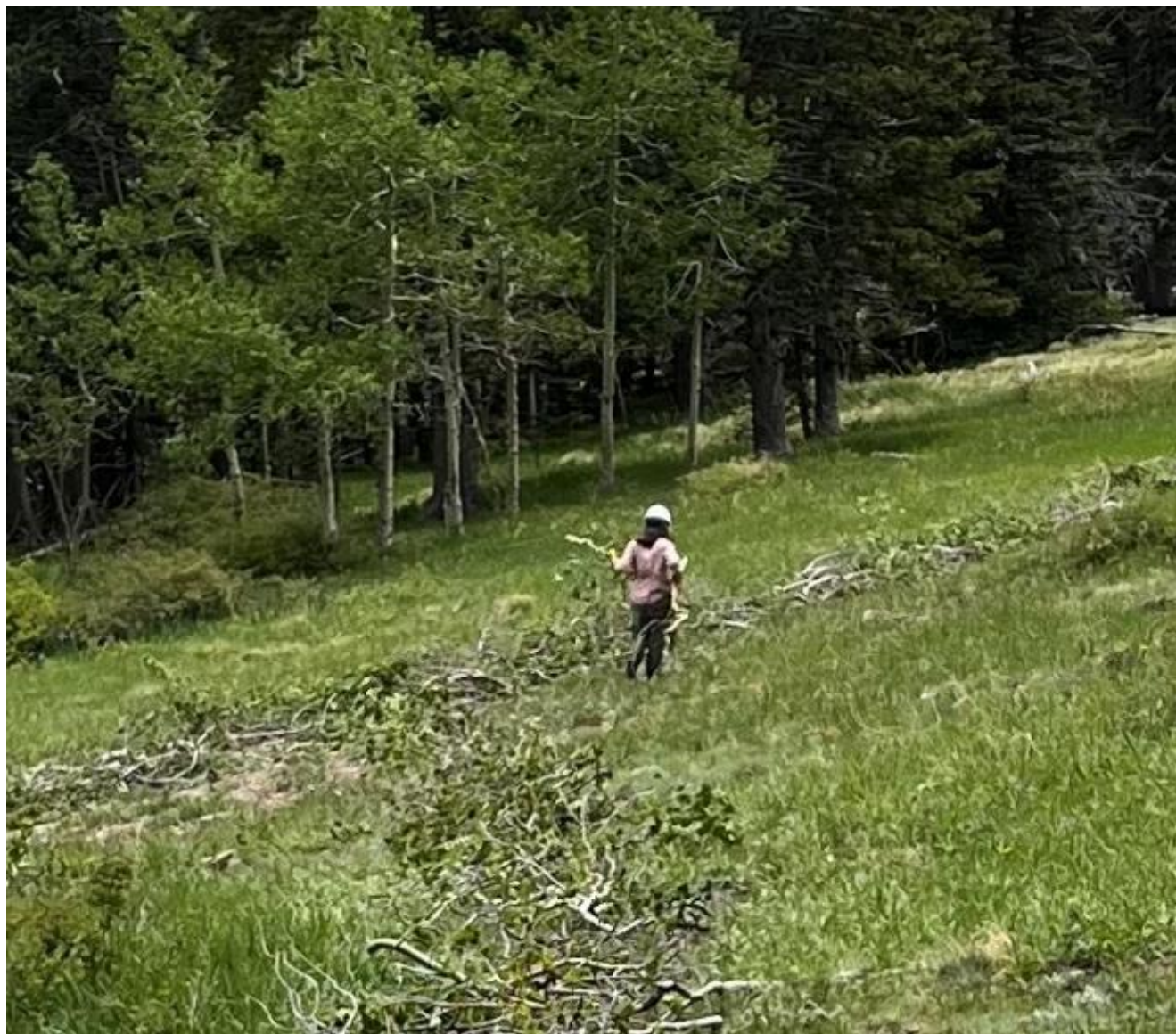
TTYL crew members placed cut aspen brush on user trails to obliterate them and discourage hiking here by visitors.