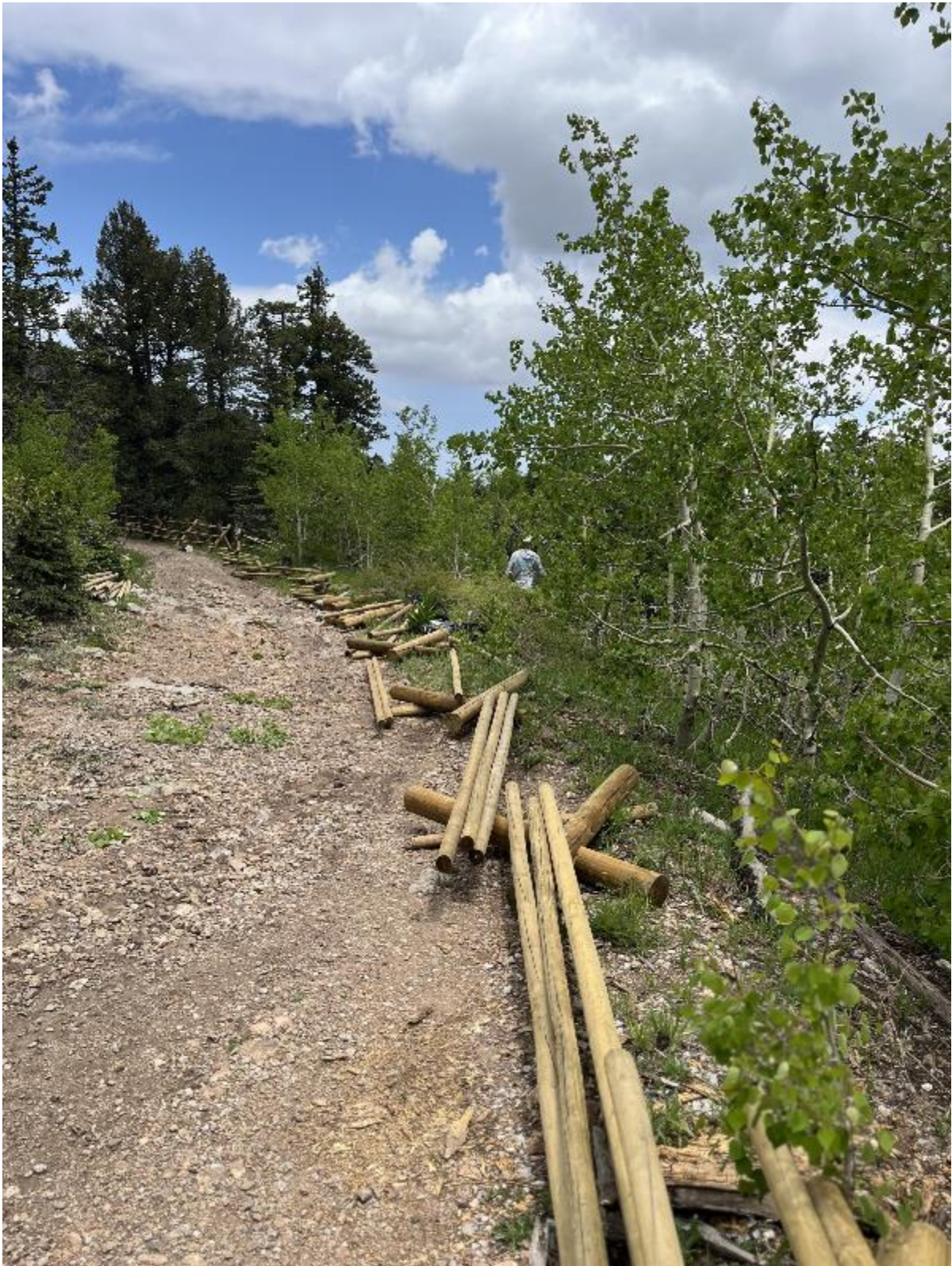
These bucks and rails will be used to extend the fence in the background long the Kiwanis Cabin Road.