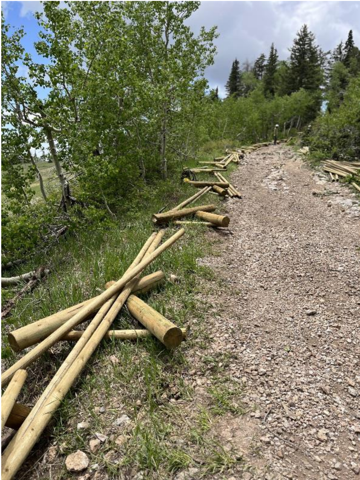
Bucks and rails along Kiwanis Meadow Road that will be used to extend the fence up the road toward Kiwanis Cabin.