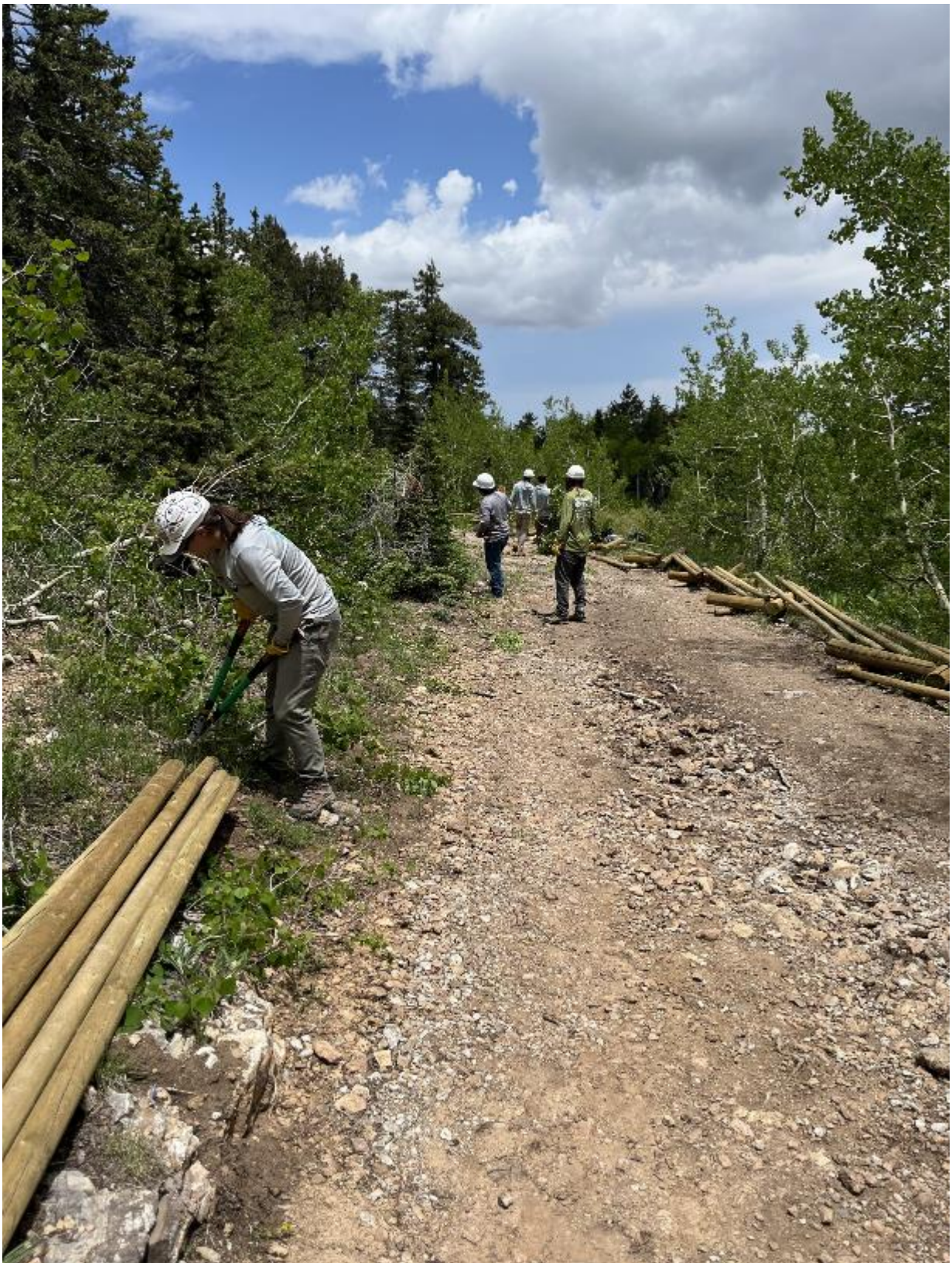
TTYL crew members continued to cut the aspen brush several hundred feet along the Kiwanis Cabin Road.