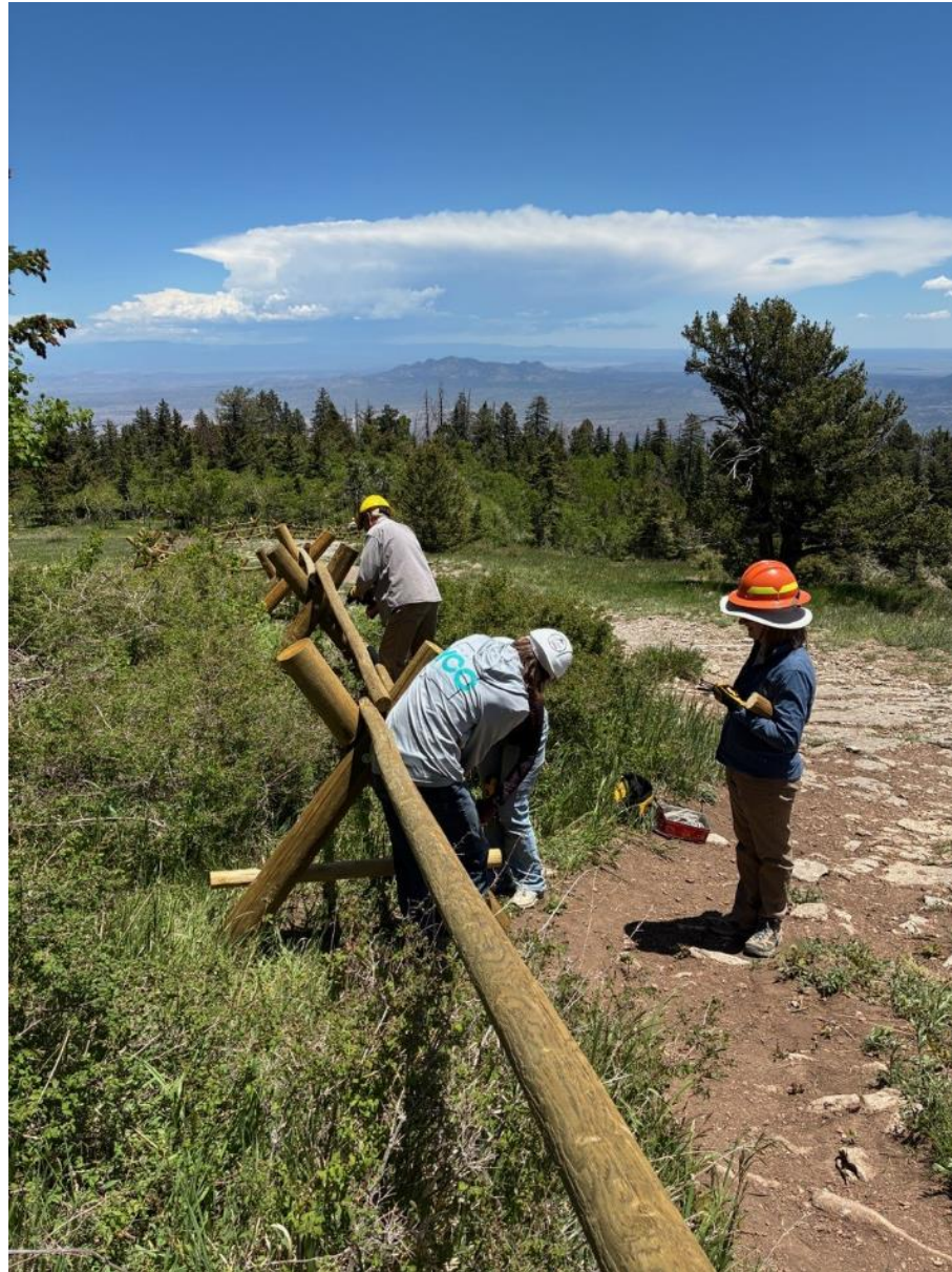
Betsy watching as two TTYL/YCC crew members install a rail with Dan in the background.