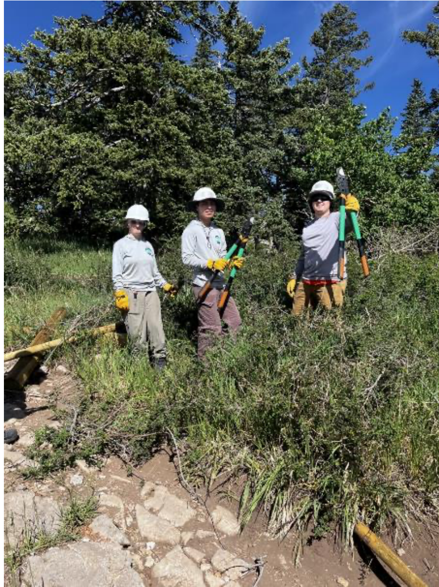
TTYL/YCC crew cutting brush where last fence section will be assembled.