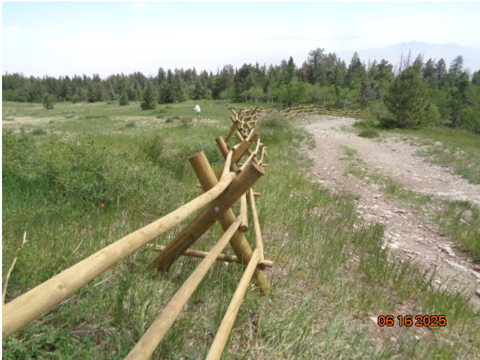
Buck and rail fence across south side of Kiwanis Meadow to discourage hiking in the meadow and creating user trails.