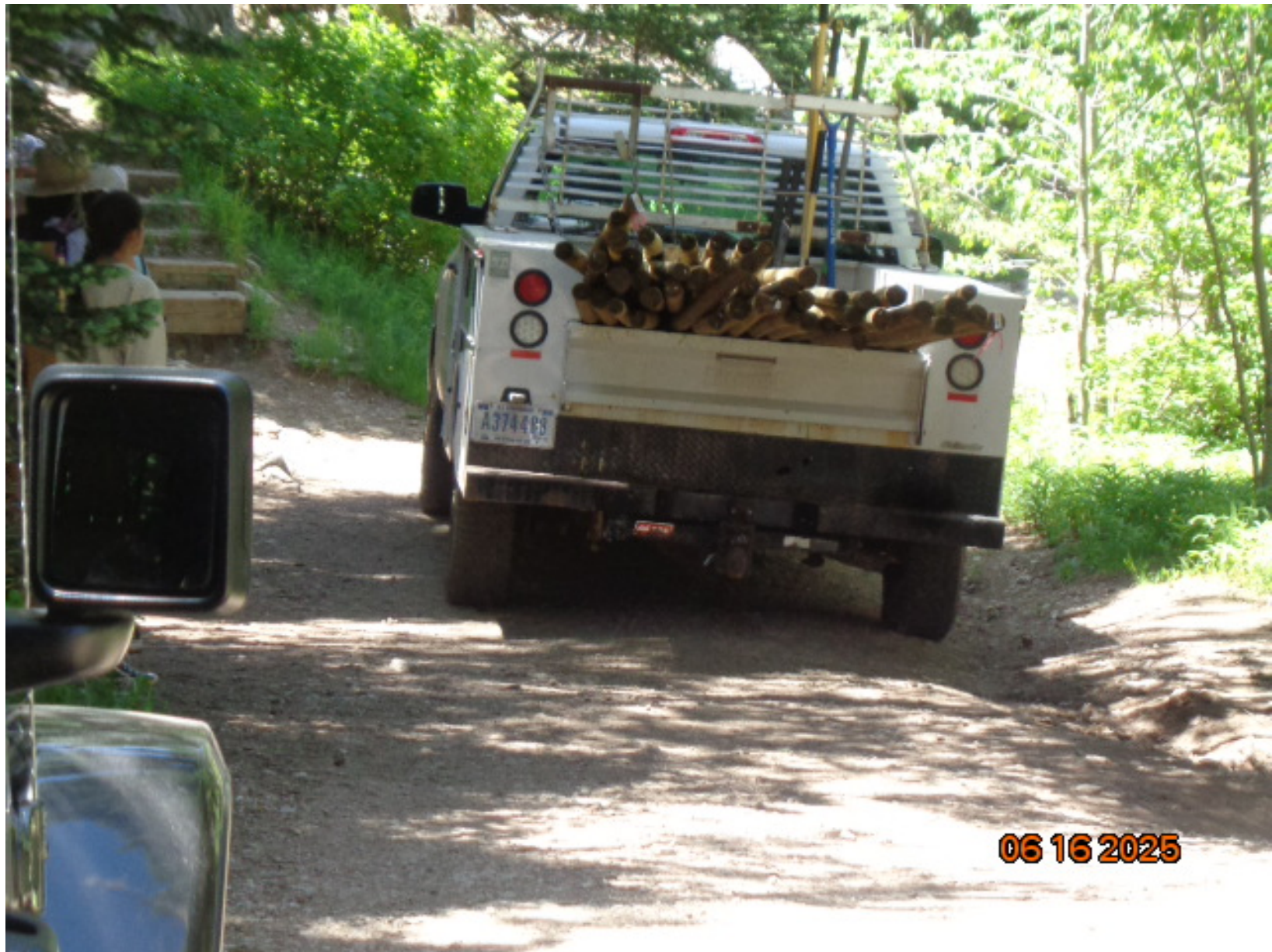
Manny's pickup crossing the South Crest Trail on its way to the Crest area and the Gravel Pit where old fence debris was loaded and taken to the transfer station. The rails were moved to a trailer before the debris was loaded on the pickup.