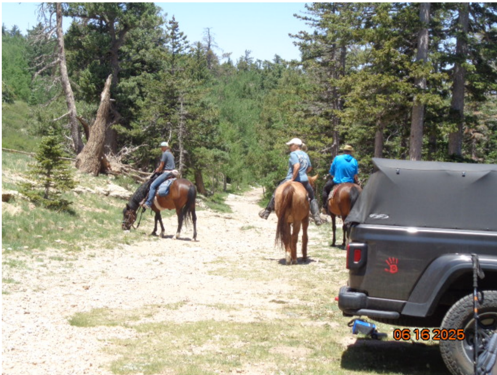
Riders leaving the parking lot at Kiwanis Cabin.