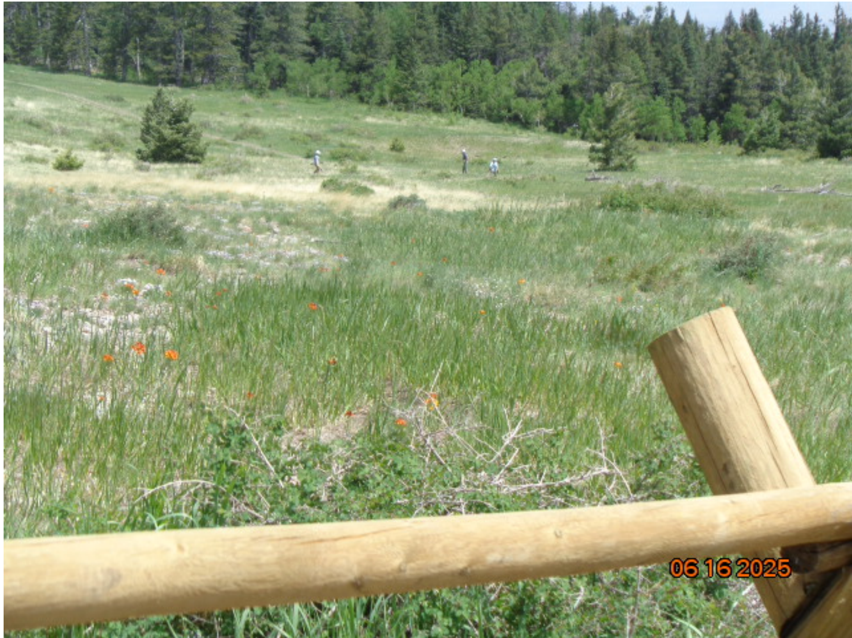
TTYL/YCC crew covering user trail with slash and old tree trunks near the south side of Kiwanis Meadow.