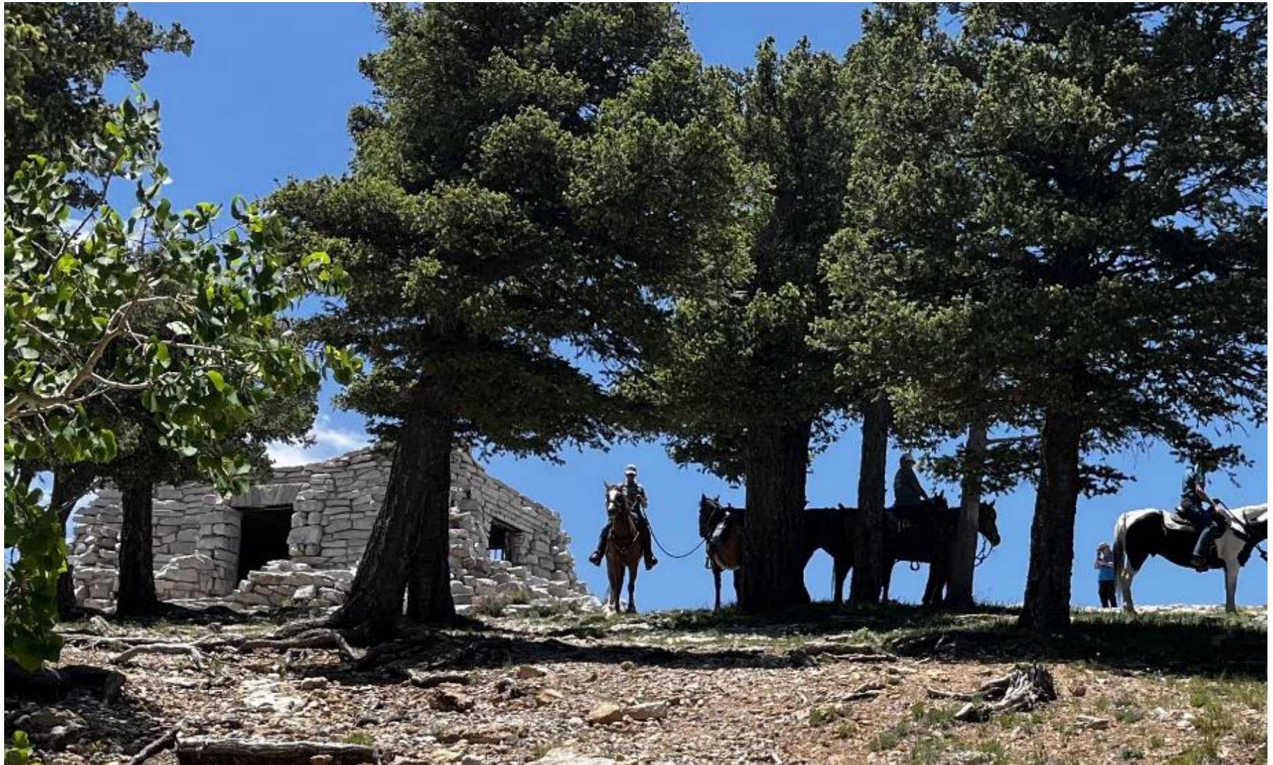
Horse back riders at Kiwanis Cabin after coming down the road from the meadow.