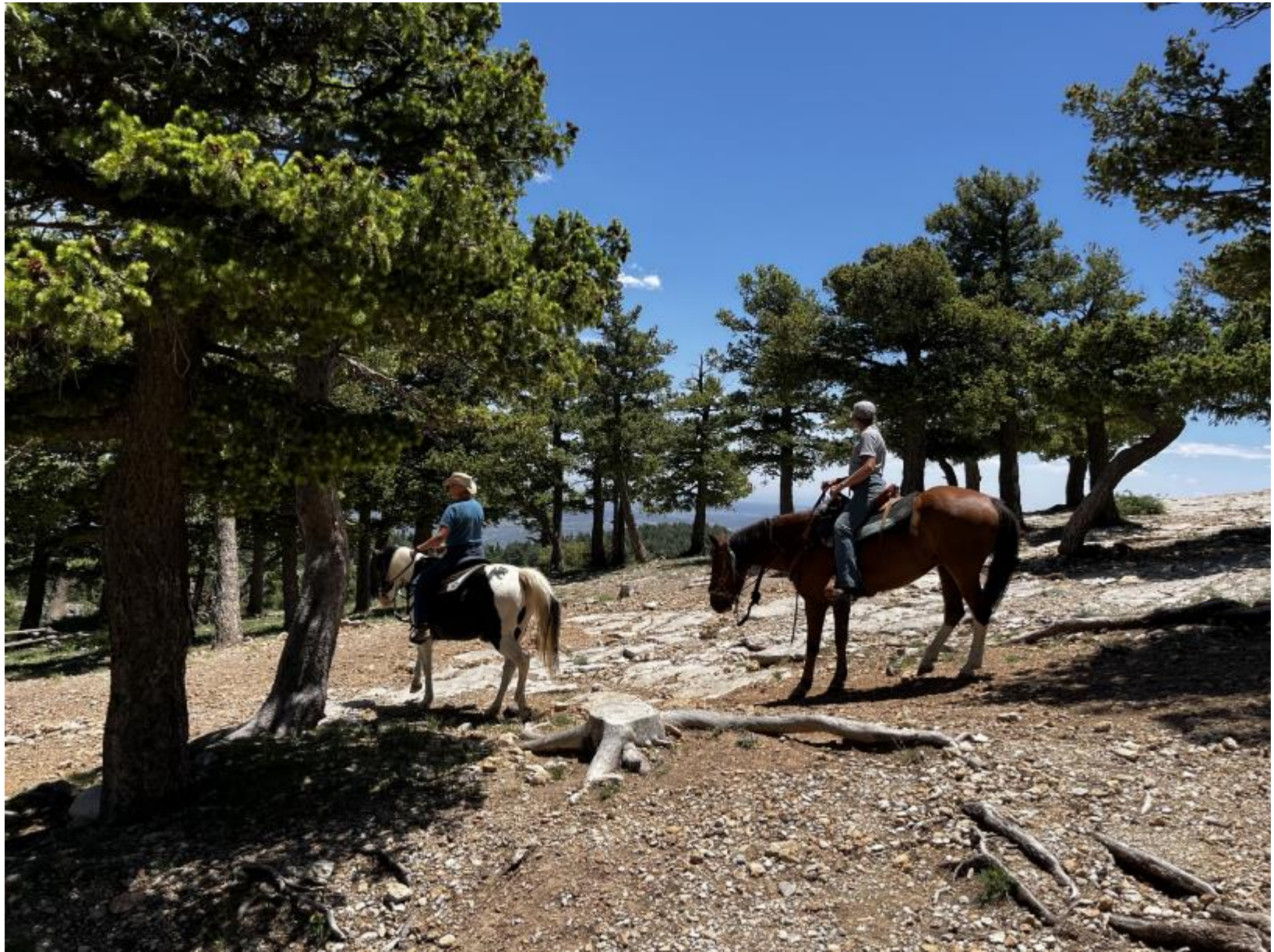
Riders leaving the Kiwanis Cabin area.