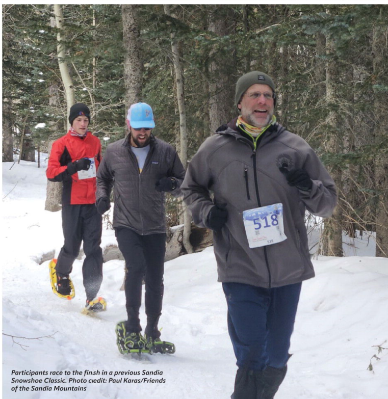
Participants race to the finish in a previous Sandia Snowshoe Classic.